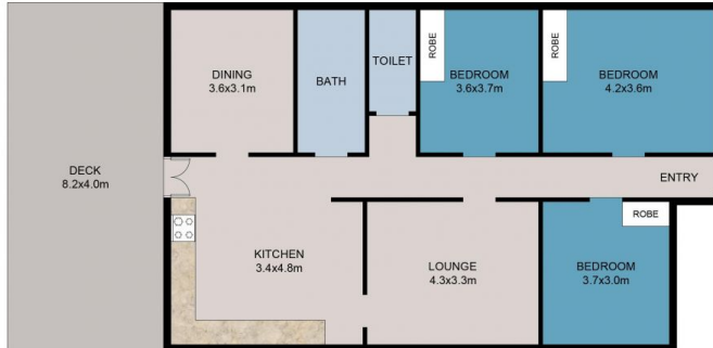
U P P E R L E V E L